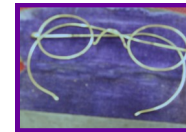
Left: Glasses Mid 20th C

We also house items reflecting the heritage of the Province, such as a version of the old and the modern habit. There are also numerous items brought back from the missions.