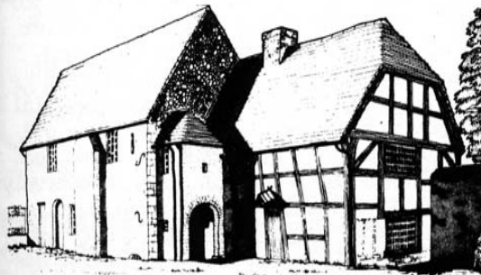
King John's House and Tudor Cottage, Romsey

Tuesday, 2nd October, saw the Public Announcement of the King John's House Appeal. It has already had an excellent start, for £1,070 has been promised of the £25,000 target. All enquiries should be addressed to: