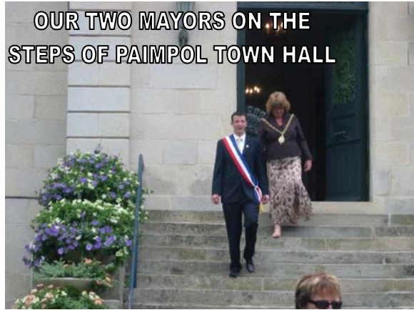
OUR TWO MAYORS ON THE STEPS OF PAIMPOL TOWN HALL

Monday morning arrived too quickly and as everyone gathered at the port to board the coach home (via Mont St Michel and Caen), twinneders old and new, hugged, kissed and shook hands in farewell, all promising to meet again next year when the Pampolais visit Romsey to celebrate the 50th anniversary of establishing the Romsey-Paimpol twinning link.