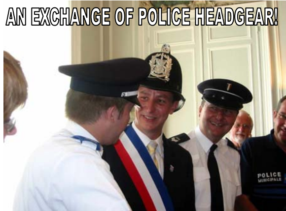
AN EXCHANGE OF POLICE HEADGEAR!