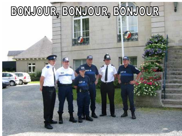
BONJOUR, BONJOUR, BONJOUR