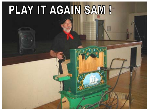
PLAY IT AGAIN SAM !